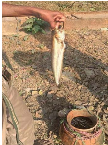
Photo: Ompak caught by fisherman